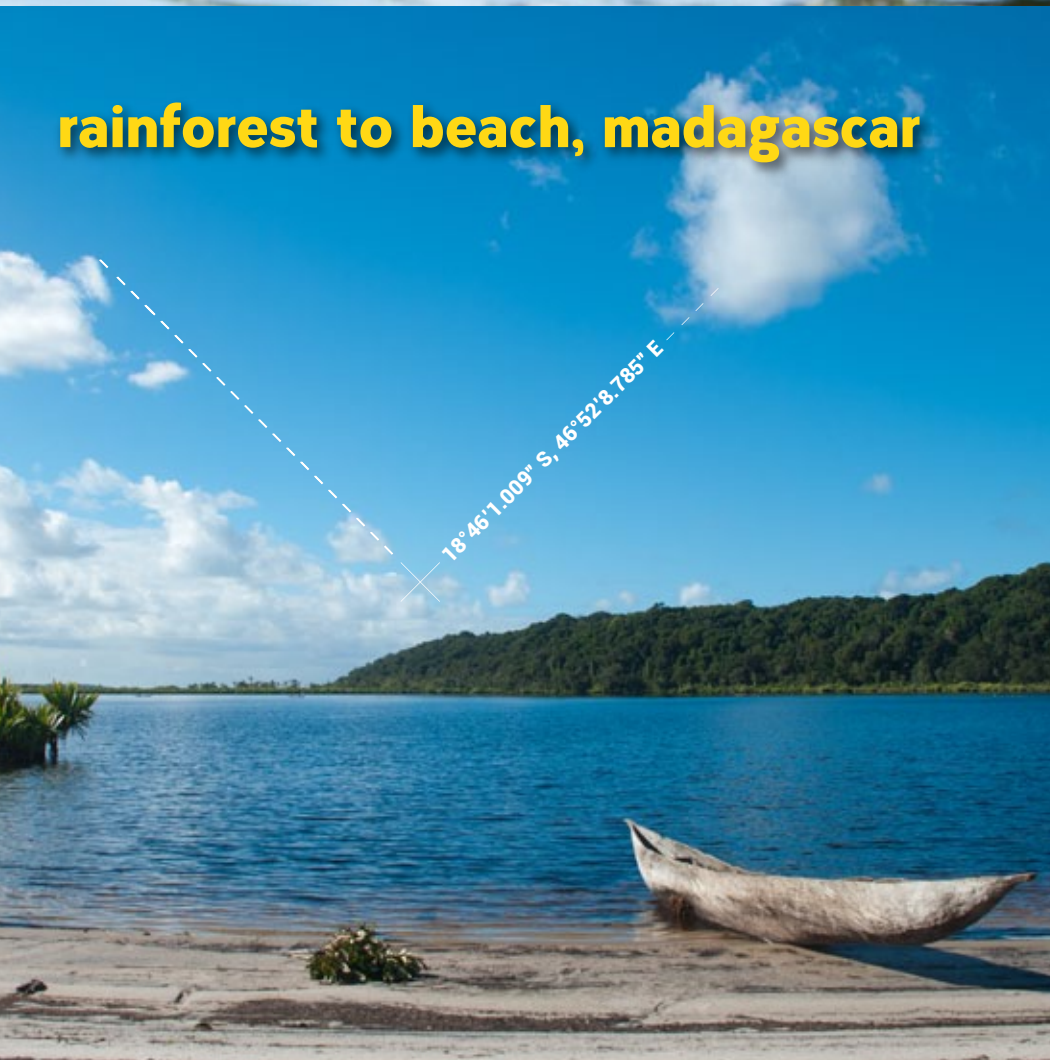
rainforest to beach, madagascar