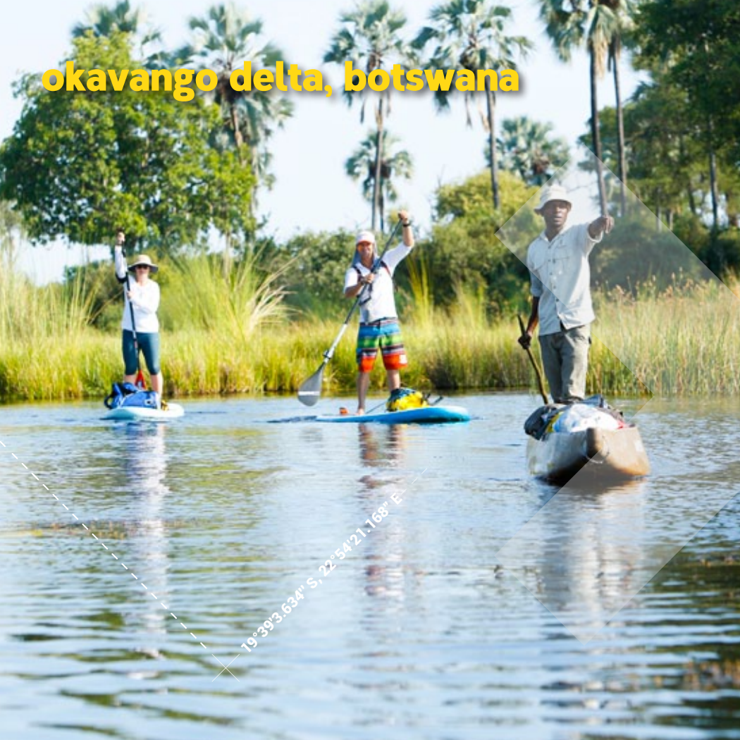
okavango delta, botswana