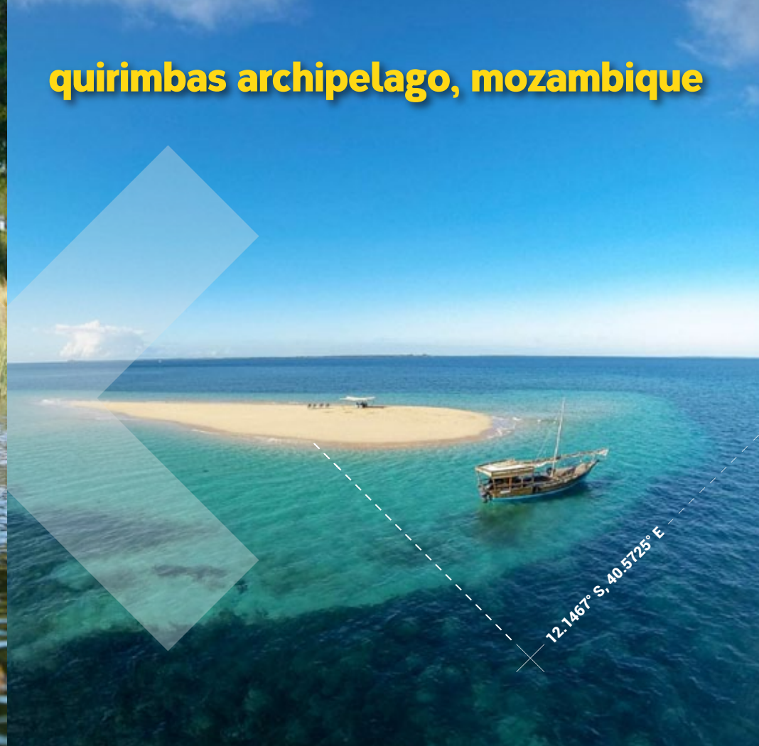
quirimbass archipelago, mozambique