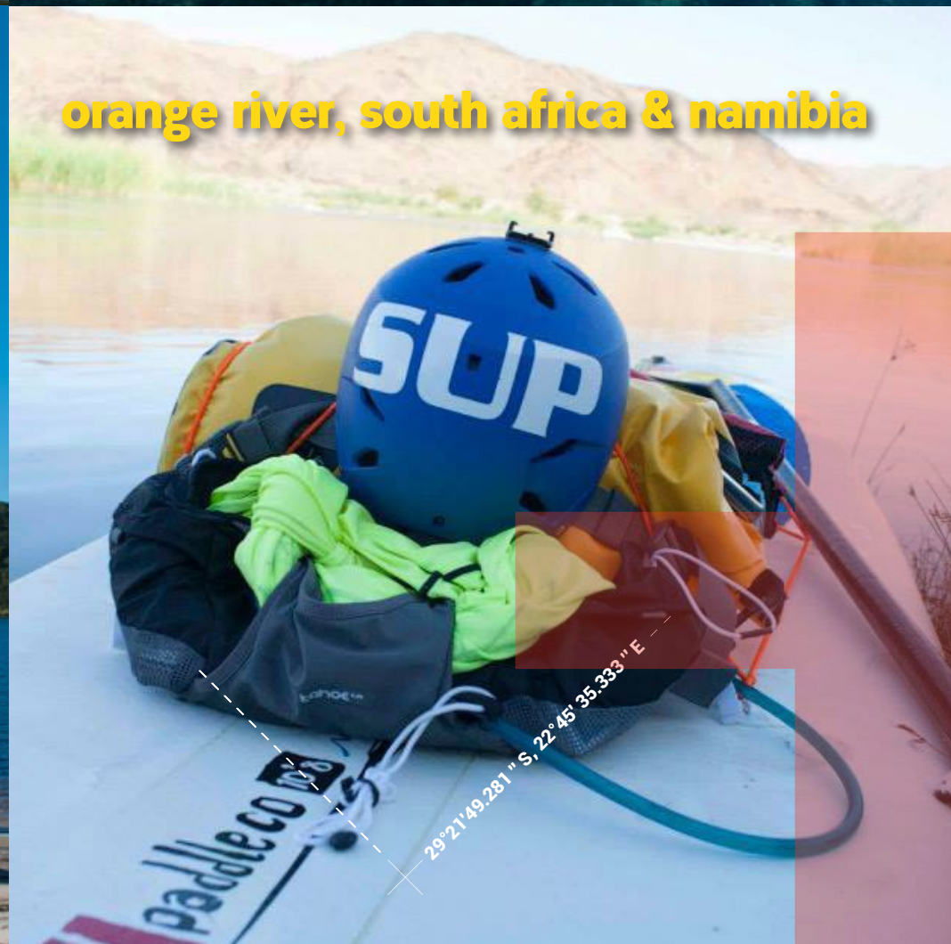
orange river, south africa & namibia